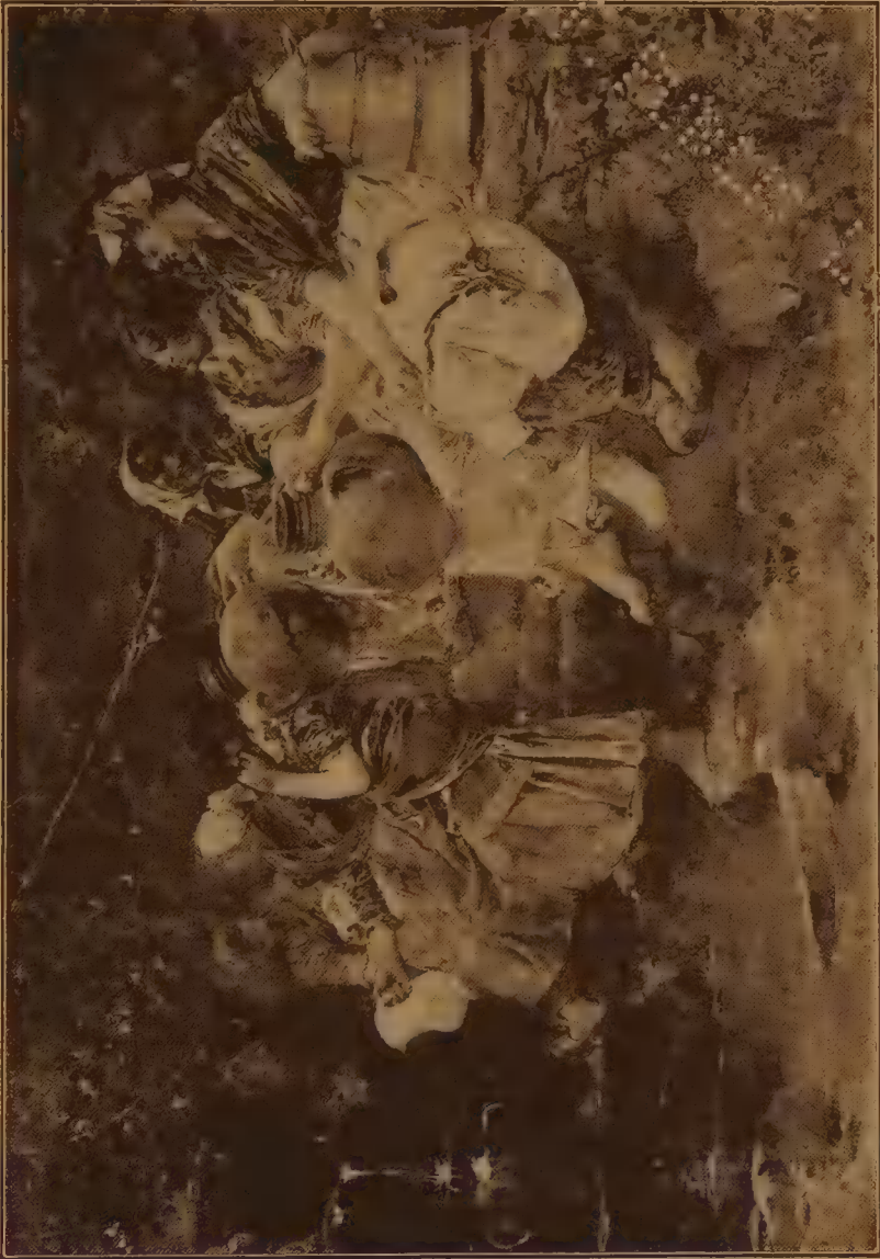
GIRLS AT THE FOUNTAIN